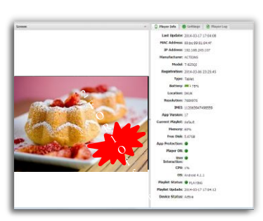
Detailed player metrics, Real time player snapshot, Player Control.

Easy to build playlists, set durations, re-order, transitions, start and end time/date, day-part control.